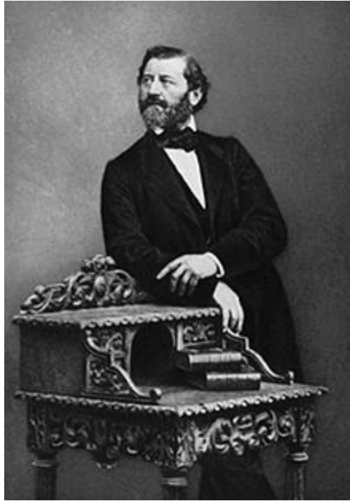
Agénor de Gasparin

Entitled Des Tables Tournantes: Du Surnaturel en Général et des Esprits [On Turning Tables: The Supernatural in General and Spirits], de Gasparin's (1854) book consisted of two volumes, which were translated into English a few years later (de Gasparin 1857; there was also a later abridged French edition in 1889). The first volume has two parts. The first one, and the one relevant for this article, is about table turning. Here he presented accounts of séances which I reproduce here, and discussed various methodological and evidential considerations.