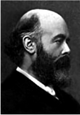
Figure 2. Oliver J. Lodge.