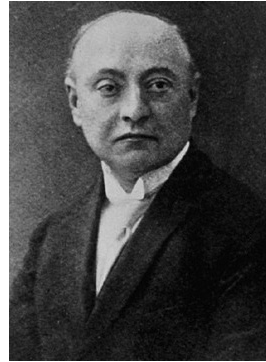
Figure 1. Gustave Geley.

d'Idéoplastie" (Geley, 1918). In this work Geley showed a vitalistic biological and physiological approach to the phenomenon, arguing that supranormal physiology was not more mysterious than conventional physiology. Both depended on the same vital processes, both constructed biological matter, and both were affected by a directing idea that determined organic processes and ectoplasmic formations outside the body. They also had in common that they worked via an organic substance that manifested inside and outside the body. This substance, Geley stated, was shaped "by a superior dynamism that conditions it, and this dynamism is itself dependent on an Idea" (Geley, 1918, p. 22).