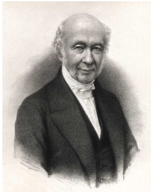
Carl Ludwig von Reichenbach

Von Reichenbach earned his reputation as an oddball even in his own lifetime primarily by his understanding