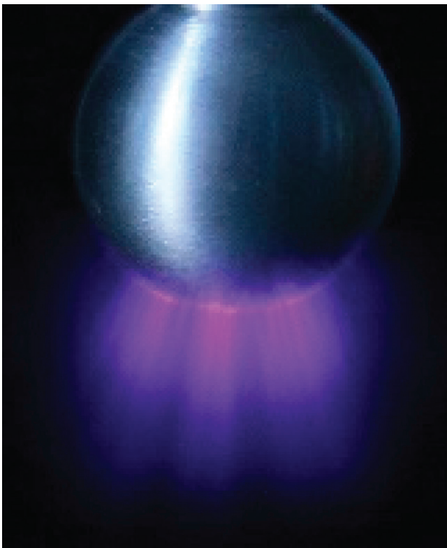
Figure 2. Direct-current corona discharge of negative polarity on a spherical surface, showing a stage with an amalgam of moving streamers blurring into a broad glow in blue to purple colours (from Riba et al., 2018, p. 10, fig. 4b).