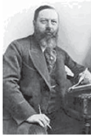
William Stainton Moses

Wedgwood, a philologist, was one of the vice-presidents of the early SPR, and one the authors of the first report of the Committee on Haunted Houses (Barrett, Keep, Massey, Wedgwood, Podmore, & Pease 1882). Furthermore, he participated in many SPR meetings (Meetings of Council 1885), and contributed cases to the spiritualist literature (Wedgwood 1881, 1883). Like other spiritualist members of the early SPR, Wedgwood fulfilled an important function in that he criticized the assumptions and methods of SPR researchers in their own publications (e.g., Wedgwood 1887). 7