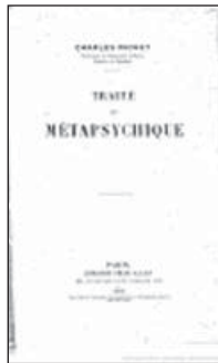
Traité de Métapsychique

Take for example the case of mesmerism, generally presented as coming before spiritualism. While the heyday of the mesmeric movement was over by the middle of the nineteenth century, belief in magnetic action continued into the late nineteenth and the twentieth centuries (Alvarado 2009b, 2009c). This was evident in the writings of philosopher Émile Boirac (1851–1917), who collected his essays in his widely cited book La Psychologie Inconnue (1908). But several others also defended the existence of a magnetic force capable of inducing trance and other phenomena, among them Alexandre Baréty (1844–1918), Hector Durville (1849–1923), and Albert de Rochas (1837–1914) (Baréty 1887, Durville 1895–1896, de Rochas 1887). Consequently, mesmerism was more than a stage taking place before spiritualism. In fact, mesmerism coexisted with spiritualism and with psychical research at different time periods.