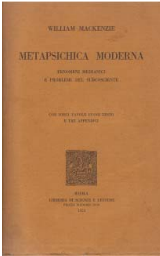
Title page of Metapsichica Moderna

of the few pieces of evidence strongly in favor of the spiritistic hypothesis, he considered direct writing and mediumistic dictation as phenomena in which counterfeiting and fraud were plentiful. It is worthy of mention, however, that the invitation that he turned to the experimenters do not blame and do not detract too much the mediums found to cheat, because fraud could also be attributed to an expression of their unconscious wishes and aspirations (p. 180ff).