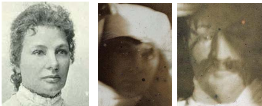
Figure 6. Madame d'Esperance (6a), enlargements of Fig. 1 (6b) and Fig. 5 (6c).

account is again devoid of any real substance or explanation for what occurred. Reference is made to an account said to be deposited in the Gothenburg Dickson Library, but a later attempt by Poul Bjerre (1958) to locate this document proved unsuccessful. With some apparent audacity, Puttock–d'Esperance published in her book edited versions of photos 1 and 3 from the Hedlund series (Figure 1 and Figure 3) and two new photographs