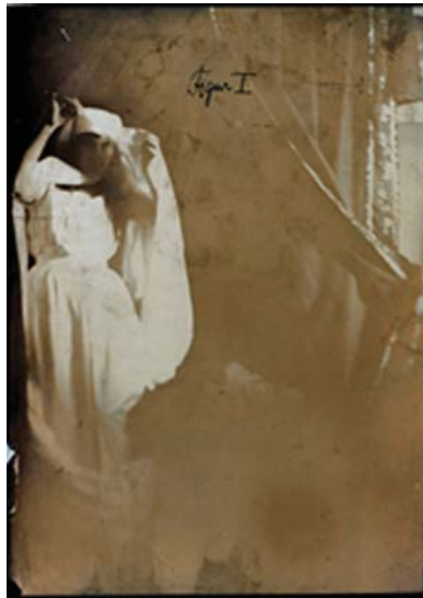
Figure 1. Madame d'Esperance.