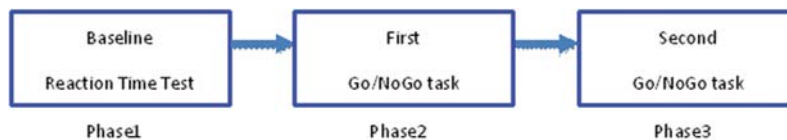
Figure 2. Flow chart of the experiment's several phases.

They were then introduced to the tasks and the shapes that were used during the two Go/NoGo tasks (see the shapes in Figure 1), and informed that they were free to quit the experiment at any time. The experiment consisted of three phases.